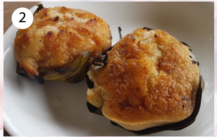
Bibingka , a baked rice cake traditionally cooked in a terracotta oven lined with banana leaves.