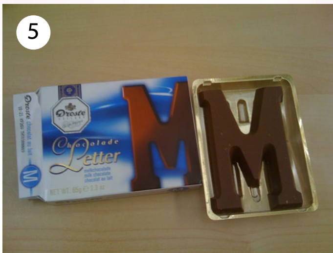
Chocolateletter , chocolate letters, usually the initials of the recipient. Each letter includes the same volume of chocolate so that wide letters like M are thinner than narrow letters like I.