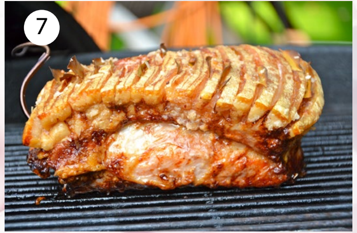
Flæskesteg , roast pork with crackling.