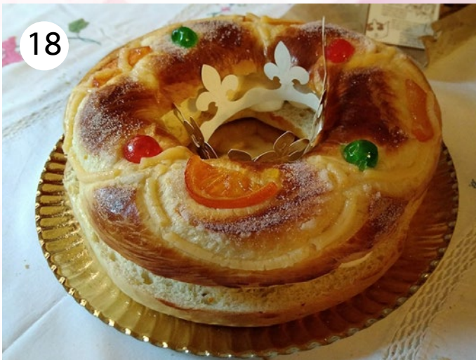
Roscón de Reyes , a round sweet bread covered in candied fruits with a hidden bean and ceramic king, eaten on 6th January to celebrate the arrival of the three wise men.