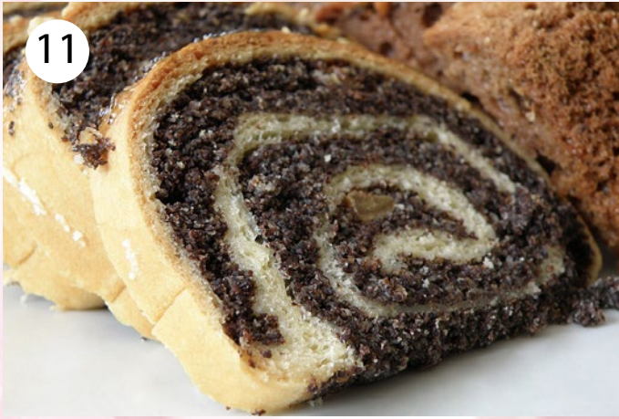
Makowiec , a roll of sweet bread with a filling of poppy seed.