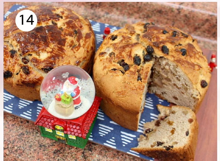
Pan de Pascua , a sweet sponge cake flavoured with ginger and honey.