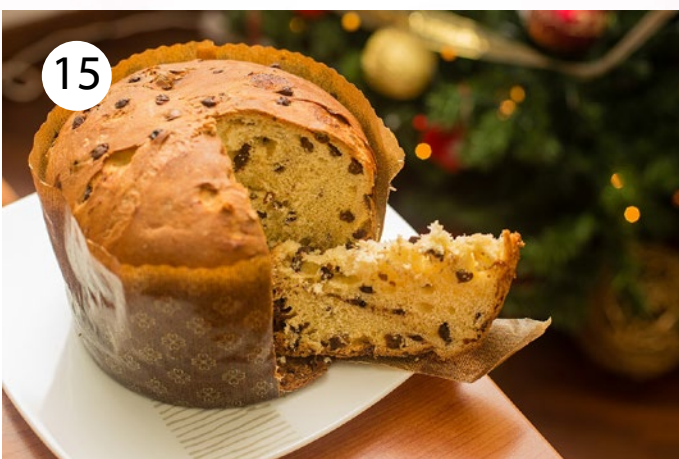
Panettone , a sweet bread.