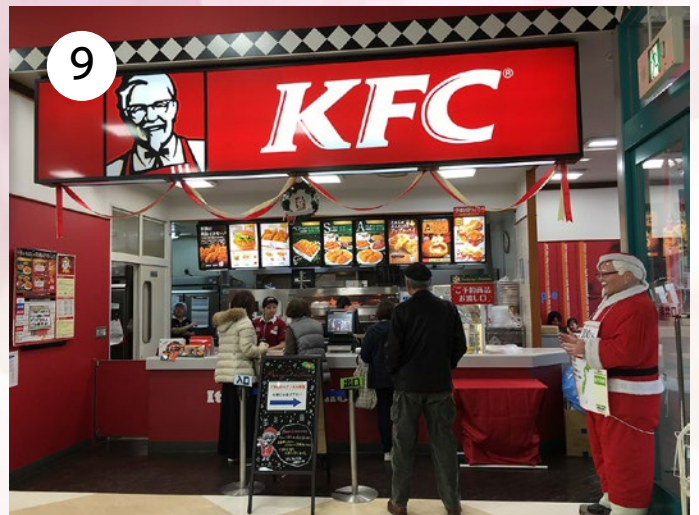
KFC , who make a chicken-scented 11 herbs & spices log that smells like KFC when you burn it on your fire. No, I'm not joking,