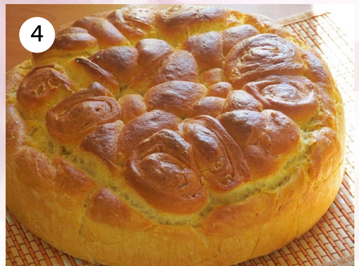
Česnica , a ceremonial round loaf of bread that often contains a hidden coin.