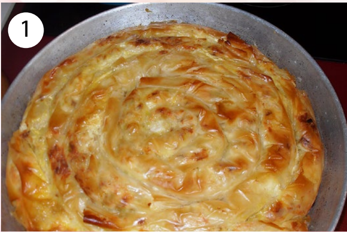
Banitsa , a pastry dish prepared by layering whisked eggs, natural yogurt and pieces of white brined cheese between filo pastry.