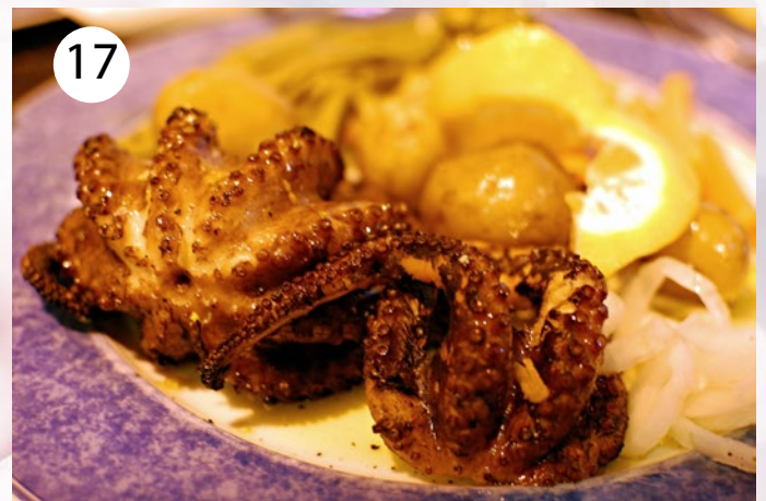
Polvo à lagareiro , octopus, olive oil, potatoes and garlic.