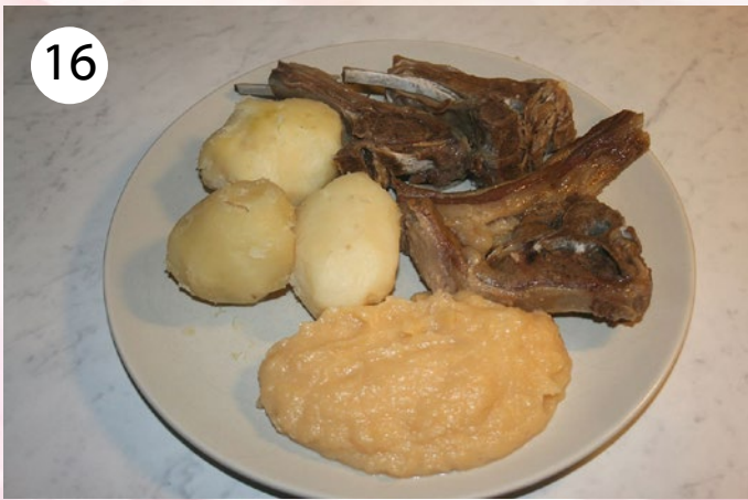
Pinnekjøtt , a main course of lamb ribs with swede (rutabaga), sausages, potatoes and akevitt .