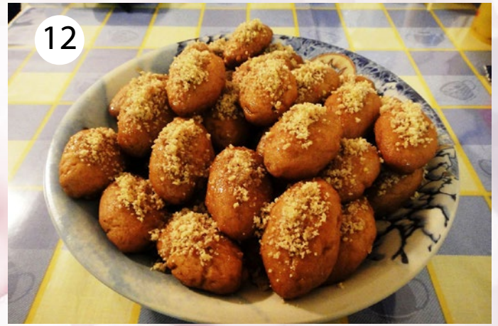
Melomakarono , an egg-shaped dessert made mainly from flour, olive oil, and honey.