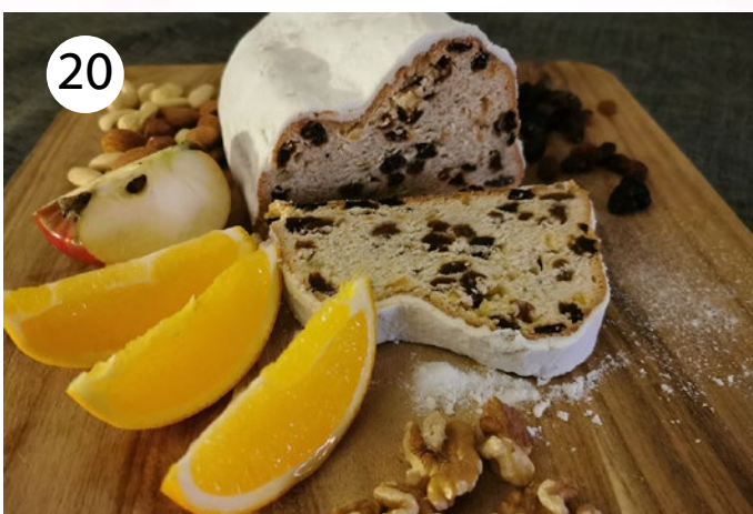
Weihnachtsstollen , a heavy fruit bread of nuts, spruces and candied fruit, often with marzipan.