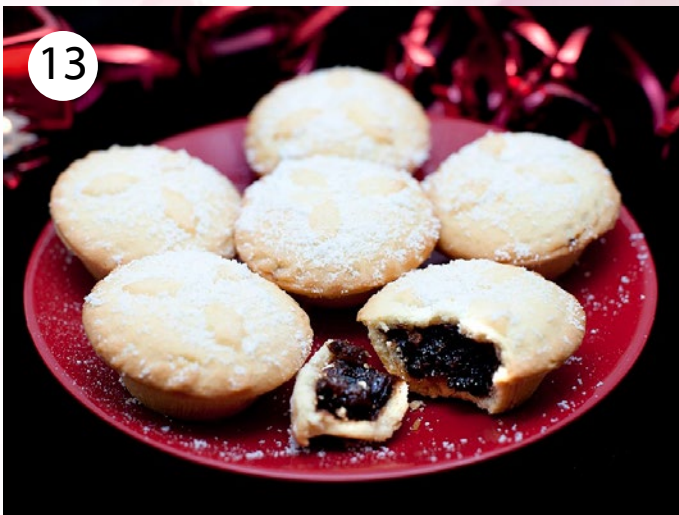
Mince pies , a small sweet pie of filled with fruit, spices and suet.