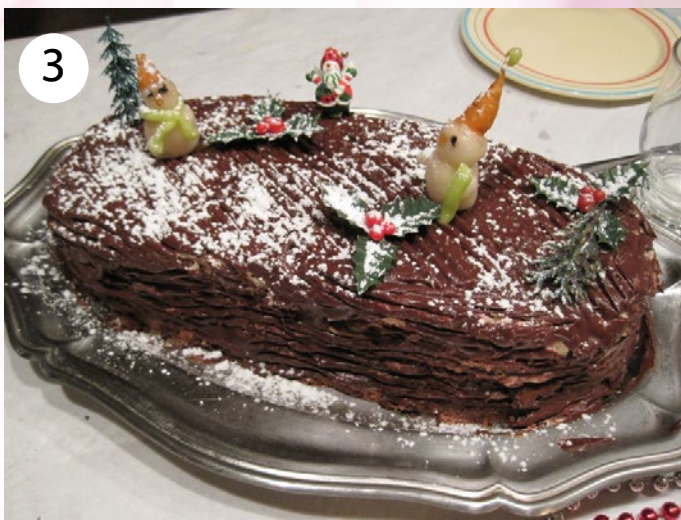
Bûche de Noël , a Christmas cake in the form of a log.