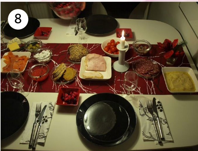
Joulupöytä , an assortment of foods usually including a ham with mustard.