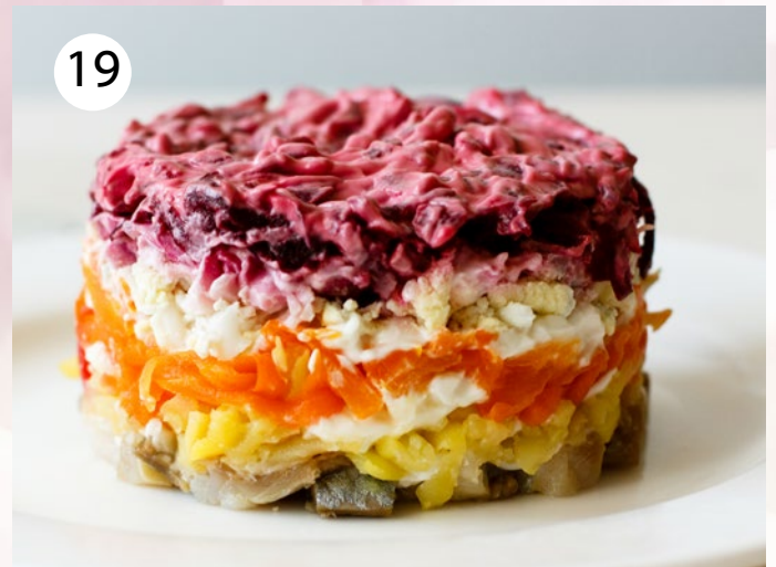
Silké pataluose , a layered salad of diced pickled herring covered with layers of grated boiled eggs, vegetables, chopped onions, and mayonnaise.