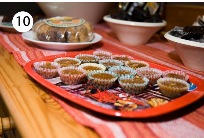
Knäck , a traditional kind of toffee.